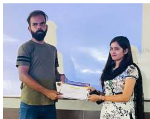
Star Coordinators @codefever