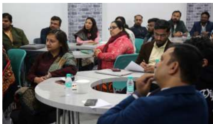
Workshop on Design Thinking