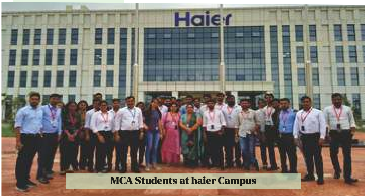
MCA Students at haier Campus