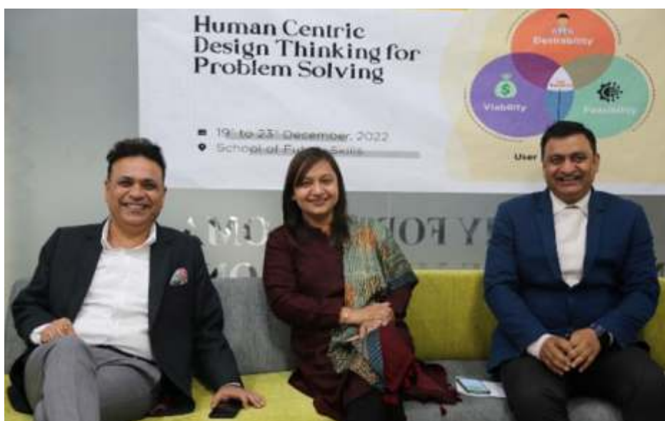
Senior Leaders at Design Thinking FDP